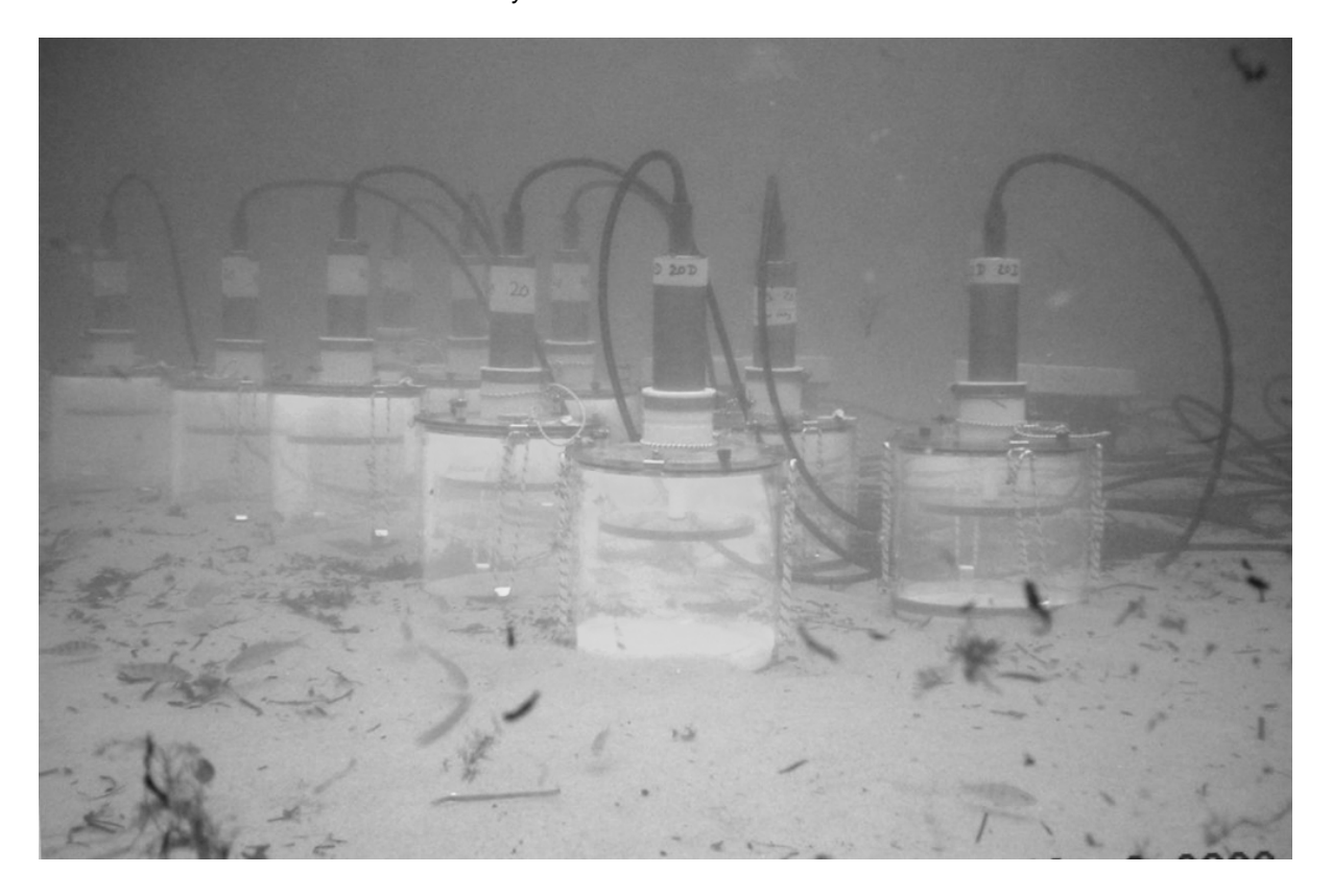
Figure 4: Advection chambers for the investigations of sediment-water exchange in permeable sediments constructed for COSA during a deployment at Hel.

The new instruments permit new insights in the functioning and the processes governing the cycling of matter in permeable marine sediments and, thus, generate fundamental data, which are needed to promote our understanding of this complex environment and to efficiently protect the coastal zone. Through increasing the knowledge and awareness concerning the sand ecosystem and introduction of improved assessment methods, COSA preserves European economical value by providing guidelines for the sustainable use of sandy coastal ecosystems. A better understanding of the sandy coastal seafloors will not only help to preserve a healthy coastal ecosystem but also ensure the quality of life, health and safety in the coastal zone and human population.